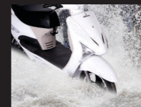
Suitable to Rainy Season