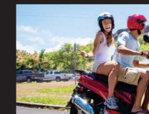
Enjoy Double Ride