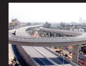
Suitable to slope road