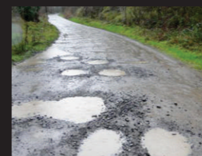
Suitable to Rough Road

ARAI Eligibility assessment report No. ARAI/AED/CT/ OC-1516-971/226 Dt. 18th June 2015